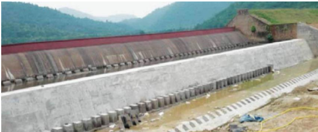
Surplus Escape of Laigaon MIP, Boudh