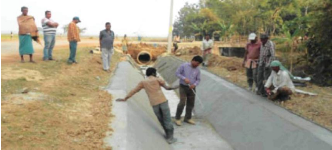
Canal C.C. Lining, Gohirakhal DW, Balasore