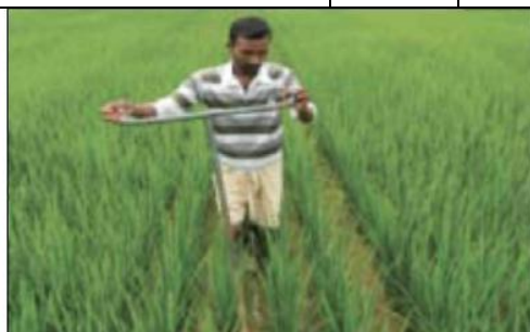
ICM paddy demo, Khurda