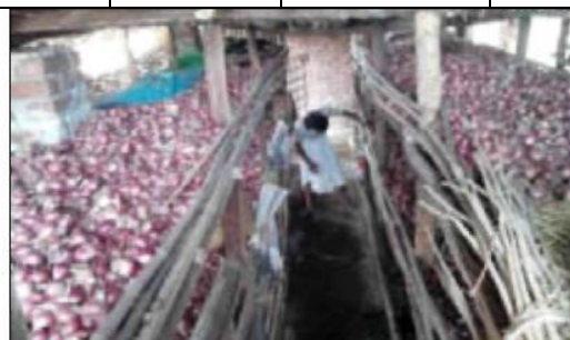
Onion value creation in Boudh District