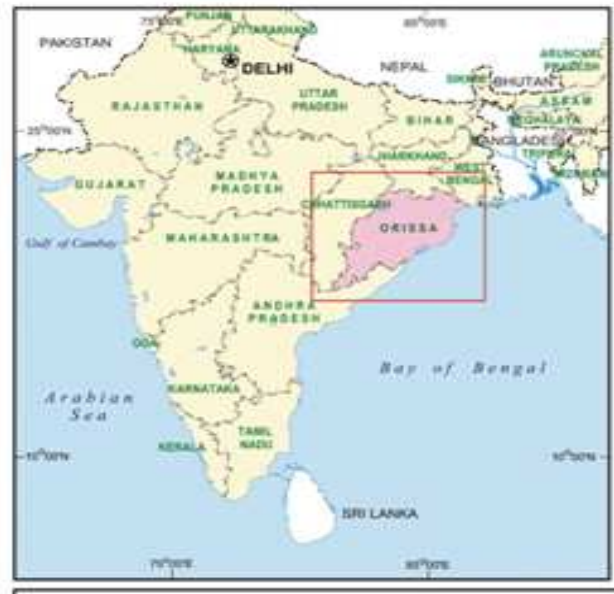
Figure 1: Location of Subproject