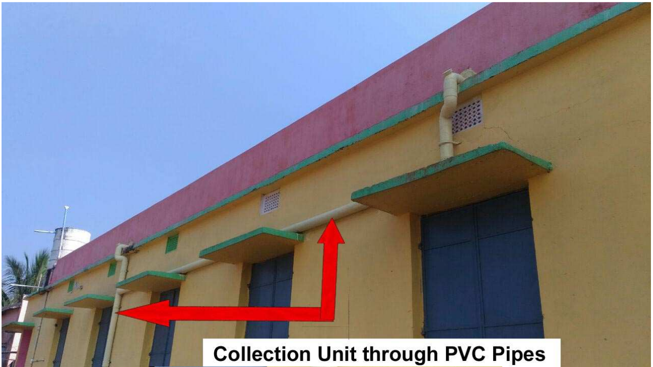
Collection Unit through PVC Pipes