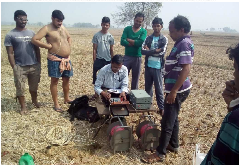
VES Test conducted to decipher Saline water interference at Jhinkiri village of Binjharpur Block under Jajpur District