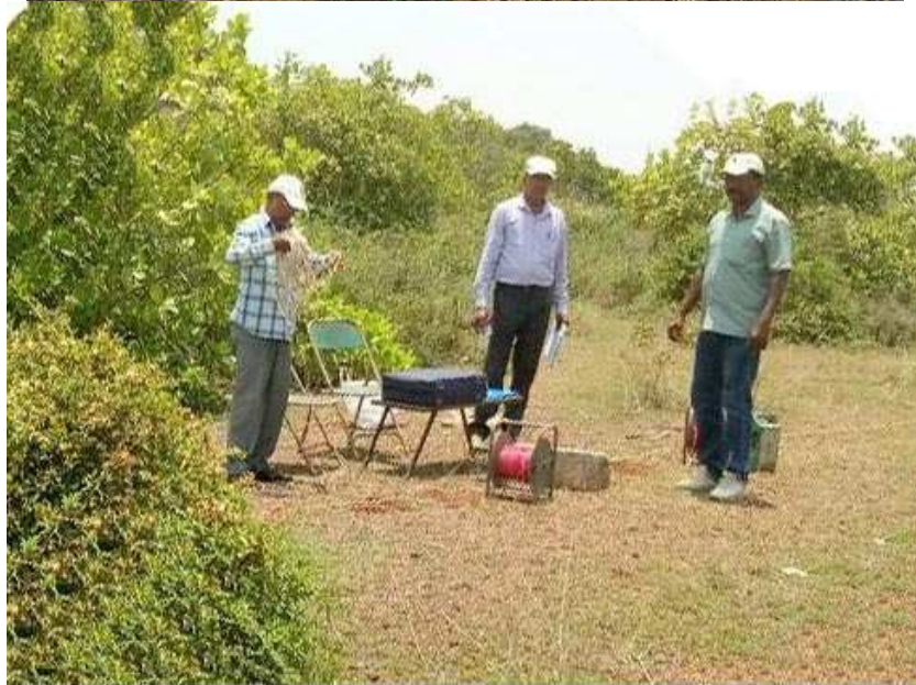
VES Test conducted for Extraction of Ground water at proposed OMFED Dairy Plant, Arilo, Govindapur, Baranga Tahasil at Cuttack District