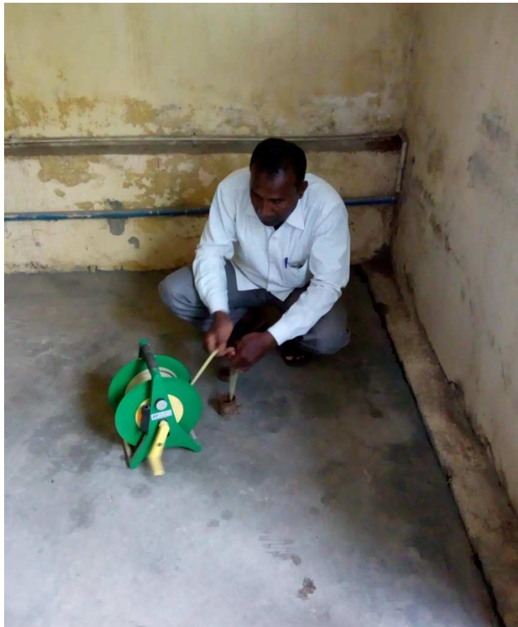
Urban Area water table Monitoring at GWD Division, Cuttack office campus during premonsoon 2018