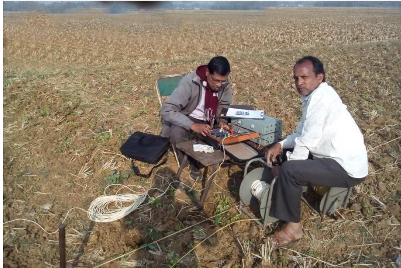
VES Test conducted to decipher saline water interference at Basudevpur Village of Binjharpur Block unde Jajpur District