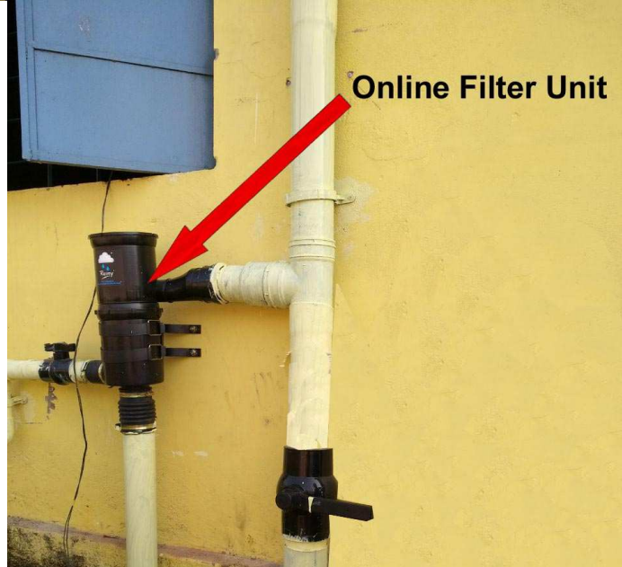
Online Filter Unit