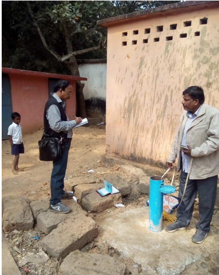
Check Measurement of Monitoring Tubewell near Anganwadi Kendra at Nahana (Balila) of Bari Block under Jajpur District