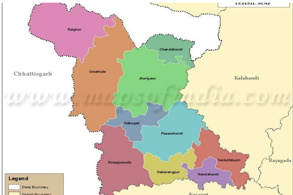
NABARANGPUR DISTRICT MAP