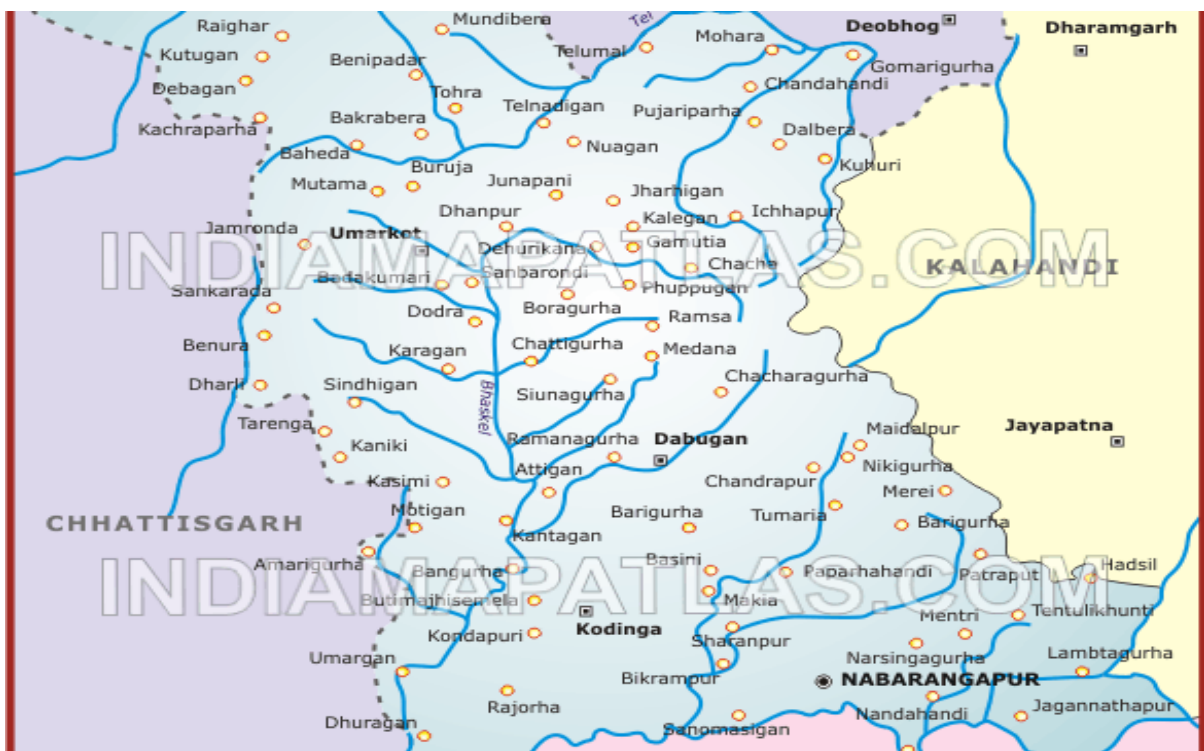
RIVER AND NALLAH OF NABARANGPUR DISTRICT.