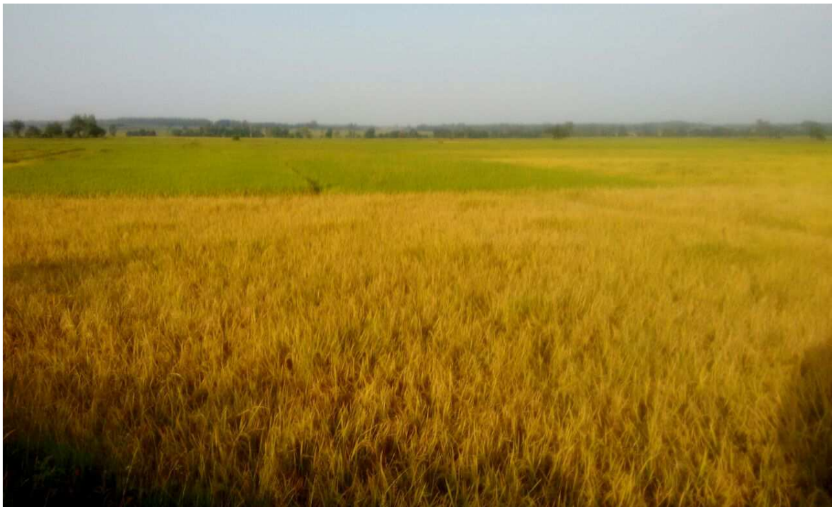
PADDY CROPS IN BHASKEL AYACUT