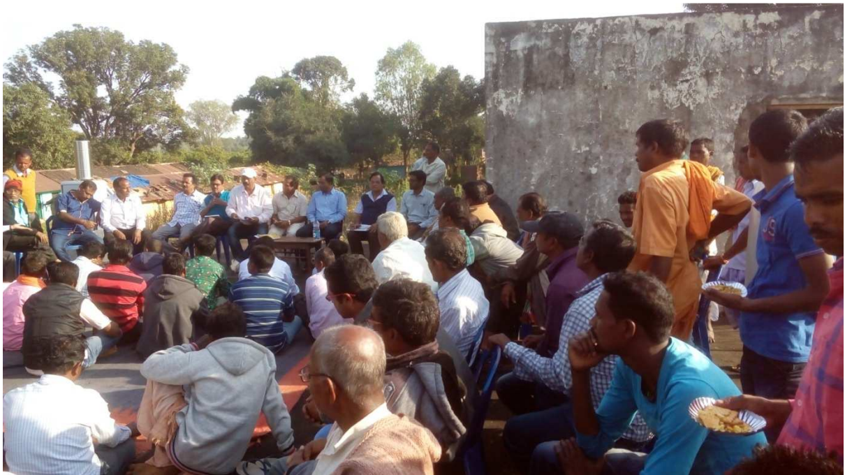
PANIPANCHAYAT APEX BODY MEETING ON THE EVE OF RABI PROGRAMME