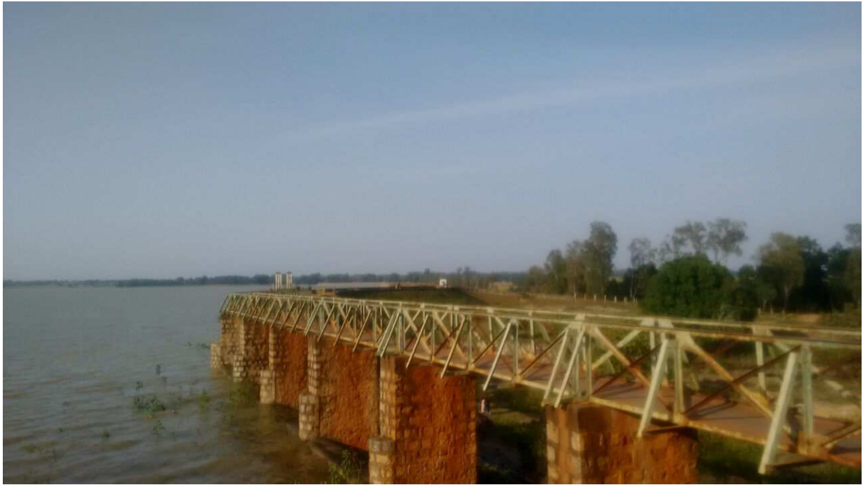
VIEW OF BHASKEL DAM DURING FULL RESERVOIR LEVEL