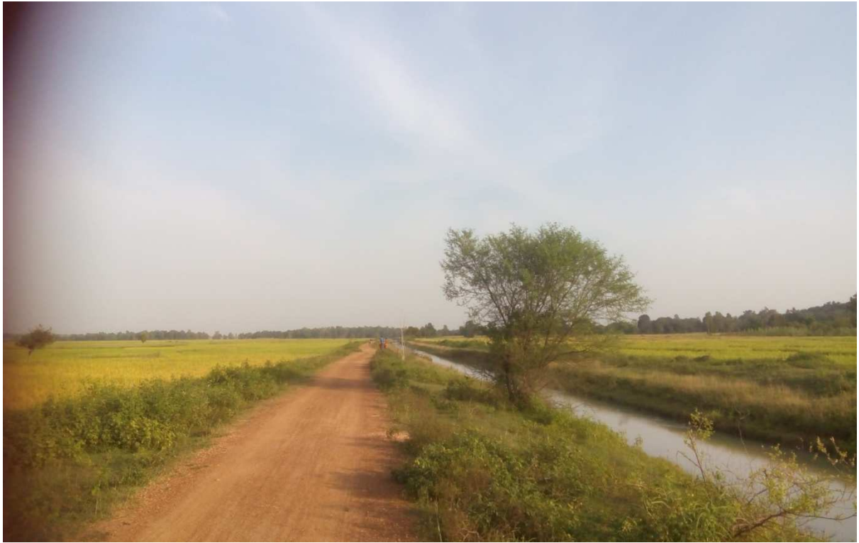
KHARIF IRRIGATION AND STANDING CROPS IN RIGHT DISTRIBUTARY