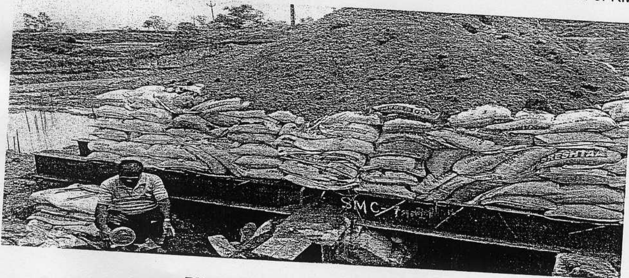
Pile Load Test at CD-40 is in progress