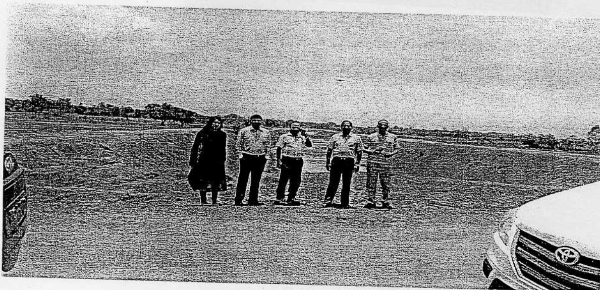
KMC at RD 30300m inspected by CE and MIS officials.