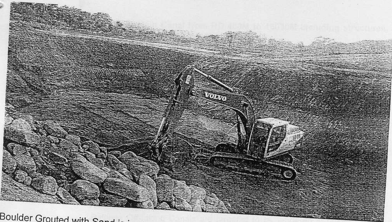
Boulder Grouted with Sand is in progress in Foundation of CD-47 at RD 38400m of KMC